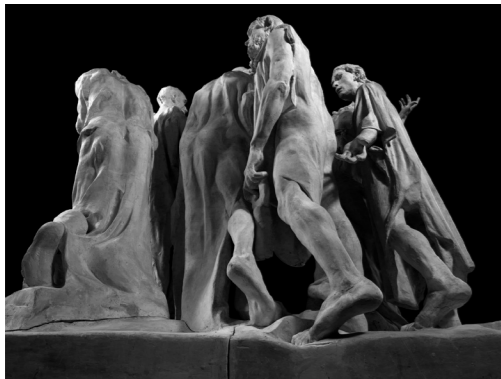
Auguste Rodin, Les Bourgeois de Calais , 1889

The paragraphs of a catalogue essay often function in a similar manner: they are accretions of language rarely read and normally valuable merely as a supplemental sort of anti-image amidst full-color artwork reproductions. Catalogue essays usually justify their existence via their texture and density more than their inherent content. They tend to be inert and somewhat self-reflexive.