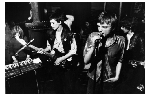
The Fall performing at The Ranch, Manchester, 1977

"These are your friends from childhood, through youth, Who goaded you on, demanded more proof, Withdrawal pain is hard, it can do you right in, So distorted and thin, distorted and thin. Where will it end? Where will it end? Where will it end? Where will it end?"