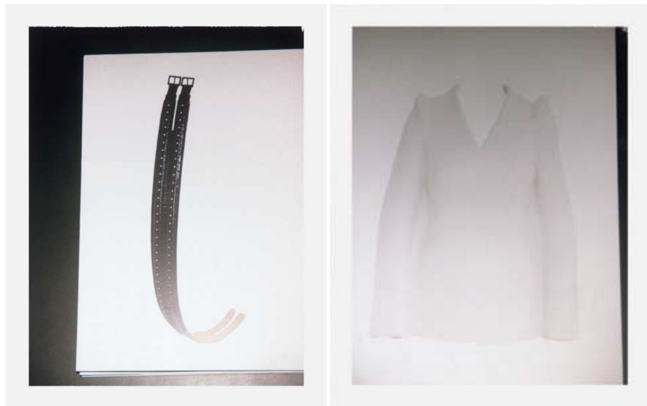
BELT, patent leather, Azzedine Alaïa, 20VII CAST, plaster/cotton lining, Martin Margiela, S/S 20IX

Left: Azzedine Alaïa is one of the true independent créateurs who has managed to withstand editorial pressures and sustain his own unique business model and position in the fashion universe throughout the years, supported by a loyal crowd of fashion insiders and fashion journalists. Elitist as it may be, it also ironically turned out to be the right formula in a fashion world in crisis. One of his designs, beautiful without being spectacular, became extremely famous and also broadened Alaïa's name immensely: a black belt, worn by First Lady Michelle Obama on several occasions. Her influence on fashion and popular American style is unprecedented. Her versatile and eclectic choice of designer fashion and high street pieces, has created a new style and physical language for first ladies as a true reflection of our times, portraying how the modern woman in general is applying fashion in a contemporary way. Her choice of embracing both American and international designers alike, as well as rather unknown or progressive designers, became an exercise in personal style that went against the absolute authority of the luxury fashion industry and luxury fashion magazines.