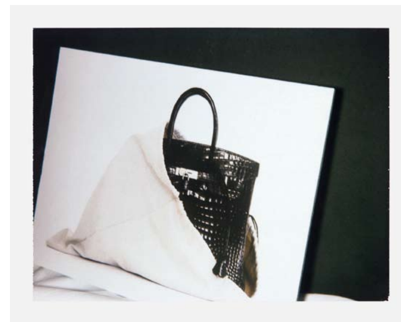
BIRKIN BAG, crocodile porosus, Hermès, 201X

The year of 2009 in fashion will, in retrospect, be remembered for what happened beyond fashion and the effect it had on the flow of the expected curve ahead. In view of social and economic turmoil, the interruption of the expected became a matter of shock and survival, brought on by extraordinary financial stress both in fashion and the real world.