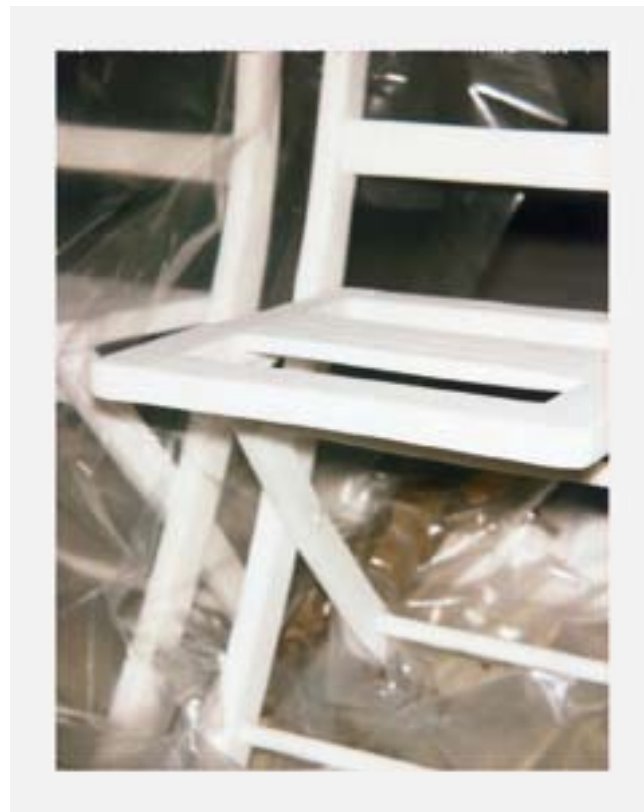
FRONT ROW, 2009 Urethane resin, pigment and filler